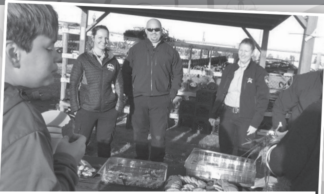
The Pennington County Sheriff's Dept. served cookies & hot chocolate & cider at the pumpkin patch event they sponsored for the children at the Cornerstone Apartments. How fun!