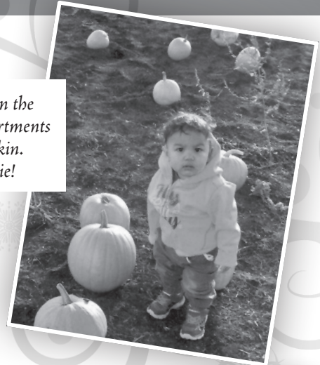
A little one from the Cornerstone Apartments picks a pumpkin. What a Cutie!