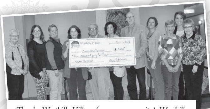
Thanks Westhills Village for your generosity! Westhills encourages everyone to join the Mayor's Challenge.