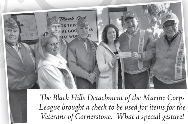
The Black Hills Detachment of the Marine Corps League brought a check to be used for items for the Veterans of Cornerstone. What a special gesture!