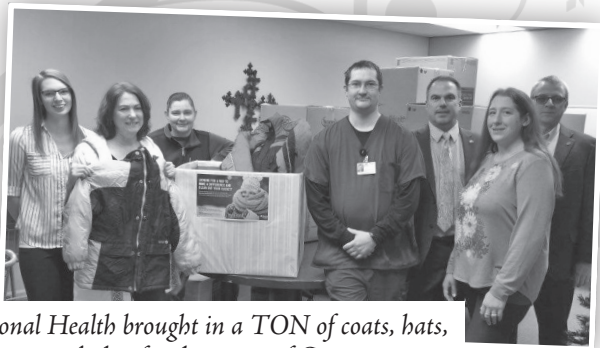
Regional Health brought in a TON of coats, hats, gloves & clothes for the guests of Cornerstone. Thanks to everyone that donated!