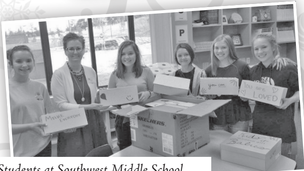
Students at Southwest Middle School collected items for the ladies at the Women & Children's Home. So thoughtful!