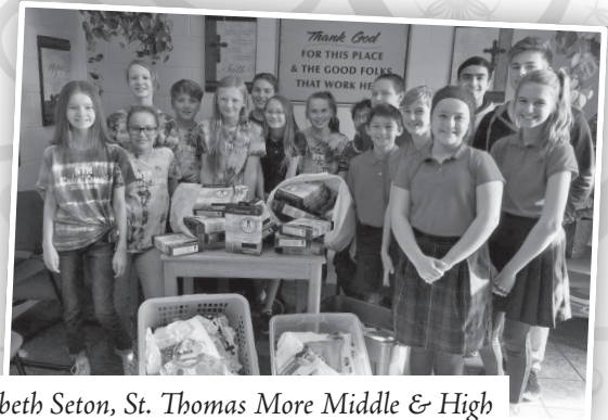
St. Elizabeth Seton, St. Thomas More Middle & High School collected many pairs of long underwear & other items to keep the guests of Cornerstone warm. A big Thank You to everyone who contributed!